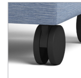
Heavy Duty Casters