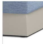
Plinth Base (see Behavioral Health Collection)