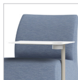
300 lb Capacity Tablet (shown with Cup Holder option)