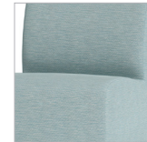
Unique one-piece Seat/Back with Cove Wipe-Out Design