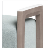
Solid Surface Arm Cap