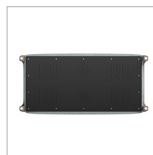
Secure Bottom Covers