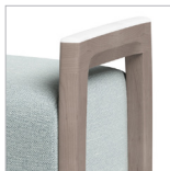
Solid Surface Arm Cap