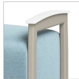
Solid Surface Arm Cap