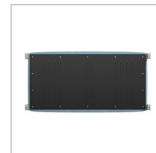
Secure Bottom Covers