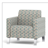
4" Upholstered Arm