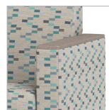
Solid Surface Arm Cap