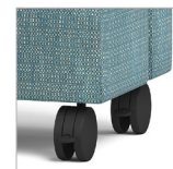
Heavy Duty Casters (not available on seating with tablet arm)