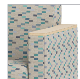
Laminate/Plywood Edge Arm Cap