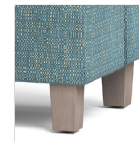
Hide & Go Mobility