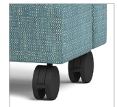
Heavy Duty Casters (not available on seating with tablet arm)