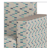
Solid Surface Arm Cap