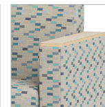
Laminate/Plywood Edge Arm Cap