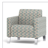
4" Upholstered Arm