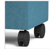
Heavy Duty Casters