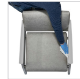
All Sides Clean-Out (Island Seat) Option