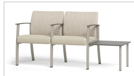
2-Seat System with End Table