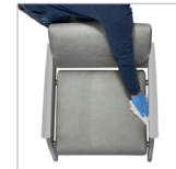
All Sides Clean-Out (Island Seat) Option