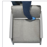
Clean-Out Feature (Standard)