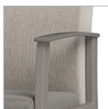
Solid Surface Arm Cap (Standard)