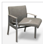
Wear Point Seat Rotation