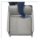
Clean-Out Feature (Standard)