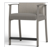
Step for User Comfort and Stability