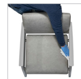
All Sides Clean-Out (Island Seat) Option