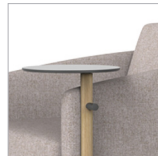
300 lb Capacity Tablet (Standard with Personal Item Hook)