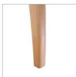
Perma-Coat Wood Leg Protector