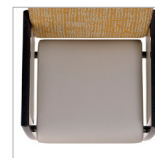
All Sides Clean-Out (Island Seat) Option