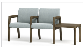
2-Seat System with End Table