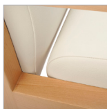
Clean-Out Feature (Standard)