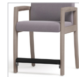
Step for User Comfort and Stability