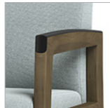
Urethane Arm Cap