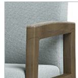
Solid Surface Arm Cap