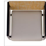
All Sides Clean-Out (Island Seat) Option