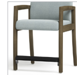
Step for User Comfort and Stability