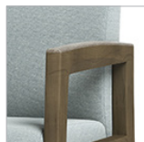
Solid Surface Arm Cap