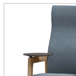
300 lb Capacity Tablet