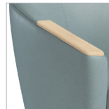
Wood Arm Cap