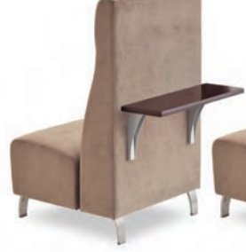
Counter Height Options