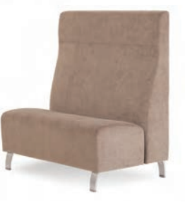
45"w Straight w 45 d 30 h 50