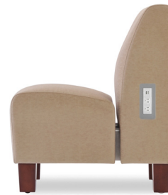
Power Port Option with Plug-in Cord Clean-Out Option shown above, must be specified