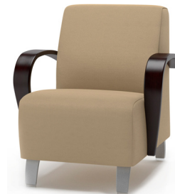
Bent Wood Arms