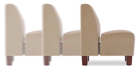
Hide & Go | Beautifully Concealed Mobility