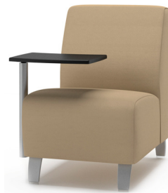
Tablet Arm Option (300 lb capacity)