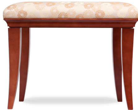
Cove edge detail & Flared leg style shown