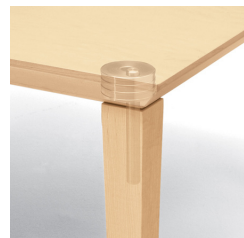
Steel Cam-&-Pin Top to Leg Connection

Note: Not all edges are available with each leg option.