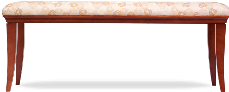
Cove edge detail & Flared leg style shown