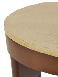
1/2" Solid Surface (epoxied on)