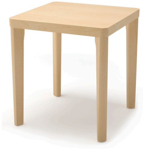
Coastal edge detail and leg style shown