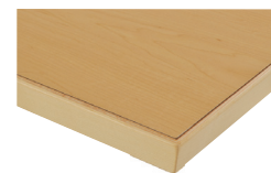
Laminate Onlay (over radiused Solid Wood Edge)