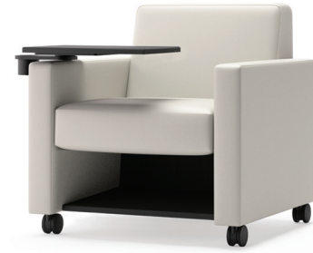
Tablet Arm with Cup Holder (300+ lb Capacity) Shelf Option (Casters shown)