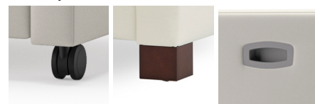
Heavy Duty Casters Hide & Go Mobility Recessed Pull Handle