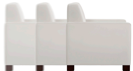
Hide & Go | Beautifully Concealed Mobility