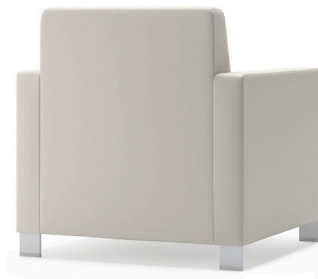
Back View (Bar Legs shown)