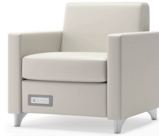
Power Port Option with Plug-in Cord (Brushed Aluminum Nave Legs shown)