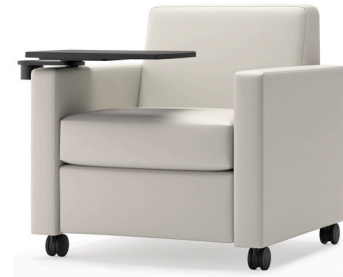
Tablet Arm with Cup Holder (300+ lb Capacity) (Casters shown - Avail. on Chairs ONLY)