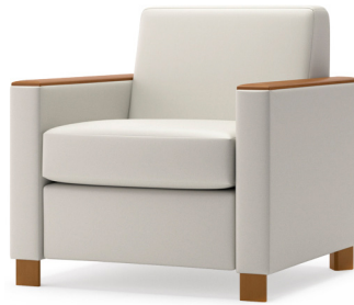
Wood & 3DL Arm Caps (Triangular Wood Legs shown)