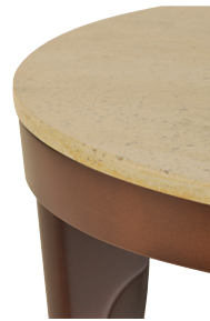
1/2" Solid Surface (epoxied on)