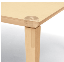
Steel Cam-&Pin Top to Leg Connection