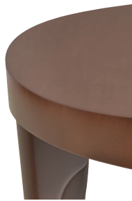
Veneer or Laminate Onlay (over Solid Wood Top)