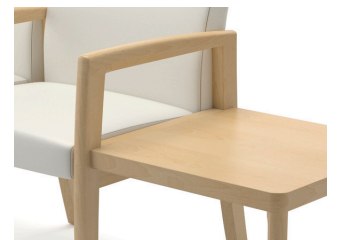
Systems (End Table shown)