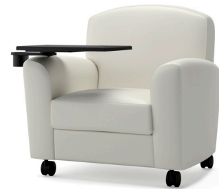
Tablet Arm with Cup Holder (300+ lb Capacity) (Casters shown - Avail. on Chairs ONLY)