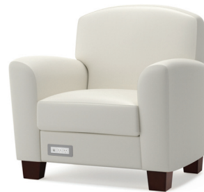
Power Port Option with Plug-in Cord