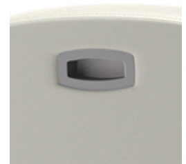
Recessed Pull Handle