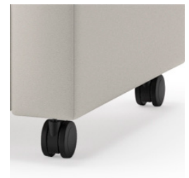
Heavy Duty Casters