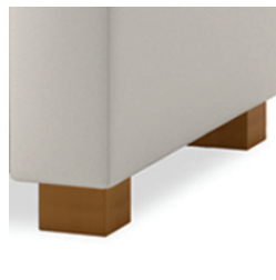
3" Wood Legs