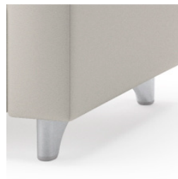
Alum. Nave Legs