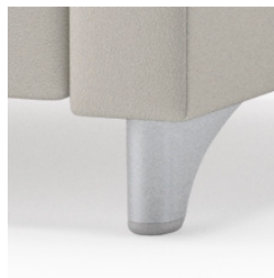
Alum. Nave Legs