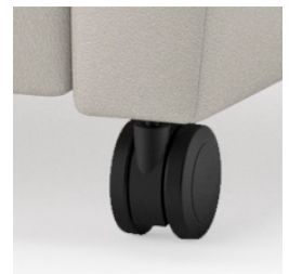
Heavy Duty Casters