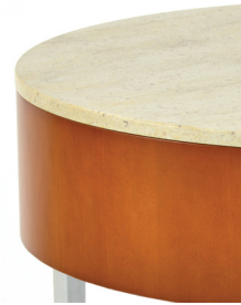
1/2" Solid Surface (epoxied on)