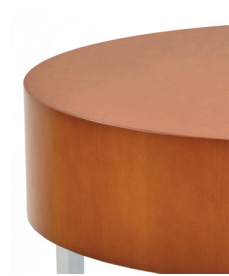
Veneer or Laminate