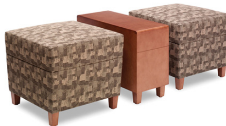
Freestanding (Half Table shown)

Note: A self-edge will be used on tables with laminate, solid surface or glass tops.