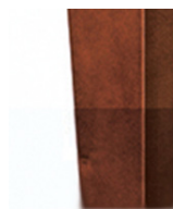
Perma-Coat Wood Leg Protector