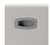
Recessed Pull Handle