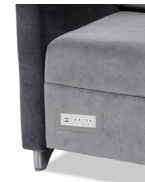
Power Port Option with Plug-in Cord