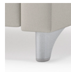
Alum. Nave Legs