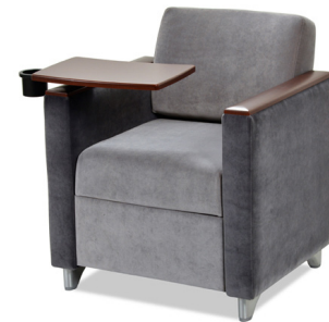
Tablet Arm with Cup Holder (300+ lb Capacity)