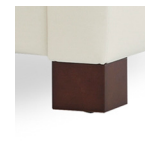
Square Wood Legs