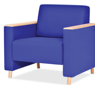
Arm Caps (HPL/Plywood Edge shown)