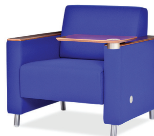
Tablet with Cup Holder & Power Port Options (Solid Wood & White Standard Plug shown)