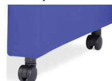
Casters (Straight Legs only)