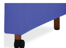
Combination Casters & Legs (Straight Legs only)