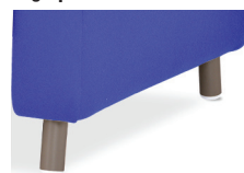
Steel Legs with Powdercoat Finish