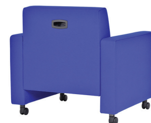
Recessed Pull Handle