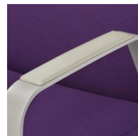
Solid Surface Arm Cap