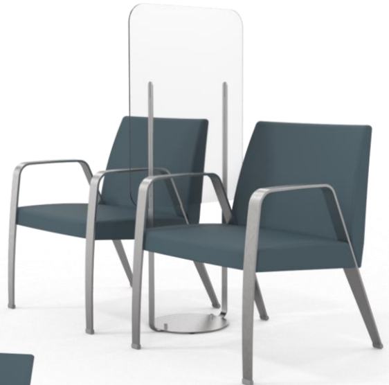
Transparent Polycarbonate Divider shown with Valayo Chairs