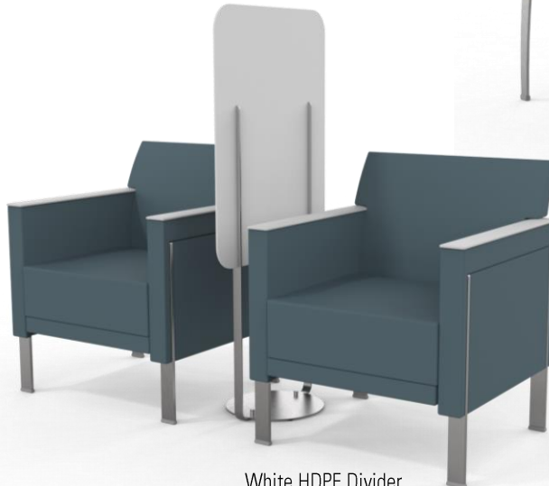
White HDPE Divider shown with Brighton Chairs