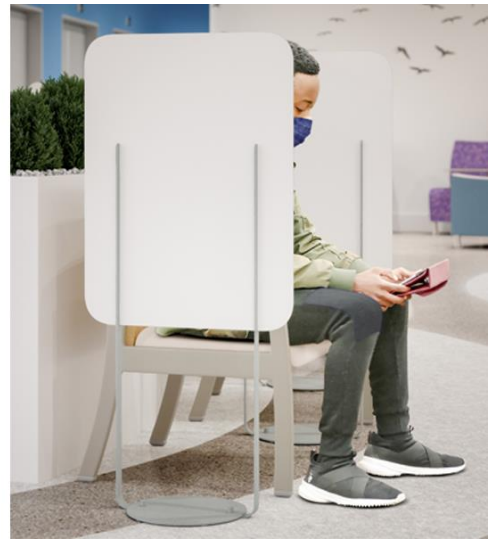
White HDPE Divider