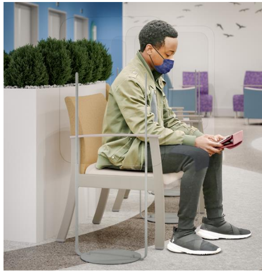
Transparent Polycarbonate Divider