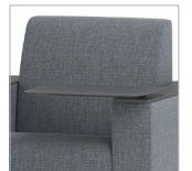
Internal Tablet with 300 lb capacity (solid surface tablet shown in 24\"/>