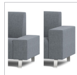
10" w Table/Arms (18" h and 24" h)