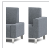
6" w Table/Arms (18" h and 24" h)