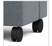
5" Heavy Duty Caster*