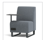
Power Port (specify seated L or R)