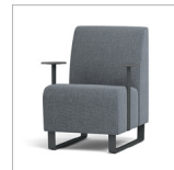
Metal T-Arms with Solid Surface Caps