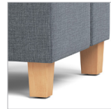
Hide & Go Mobility (recessed inline caster in front, dome glide on back)*