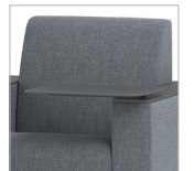
Internal Tablet with 300 lb capacity (solid surface tablet shown in 24\"h table/arm)