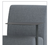
External Tablet with 300 lb capacity (solid surface tablet shown)*