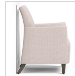
Wall Saver Design