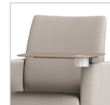
300 lb Capacity Tablet (shown with Cup Holder option)