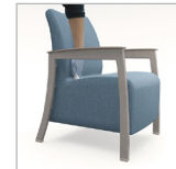
Unique one-piece Seat/Back with Cove Wipe-Out Design