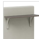
Counter (solid surface counter shown)