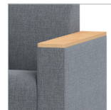
Laminate/Plywood Edge Arm Cap