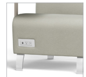
Power Port (specify seated L or R)