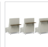
30\", 36\", 42\"/>