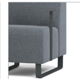
Metal T-Arm with Solid Surface Cap