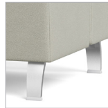
Brushed Aluminum Leg