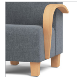
Bent Wood Arm