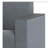
Solid Surface Arm Cap