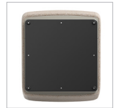
Secure Bottom Cover with Tamper-resistant Fasteners