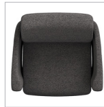
Upholstered Arm design creates clean-out