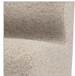
Unique one-piece Seat/Back with Cove Wipe-Out Design