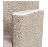
Upholstered Arm with Solid Surface Arm Cap