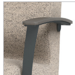
Metal Arm with Solid Surface Arm Cap