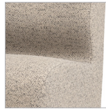
Unique one-piece Seat/Back with Cove Wipe-Out Design