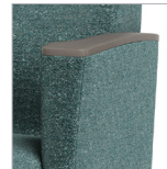
Upholstered Arm with Solid Surface Arm Cap