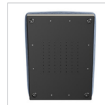
Secure Bottom Cover with Tamper-resistant Fasteners