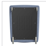
Secure Bottom Covers