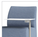
300 lb Capacity Tablet (shown with Cup Holder option)