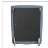
Secure Bottom Covers