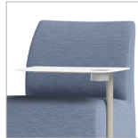
300 lb Capacity Tablet (shown with Cup Holder option)