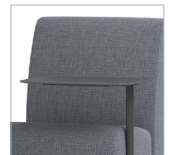
External Tablet with 300 lb capacity (solid surface tablet shown)*