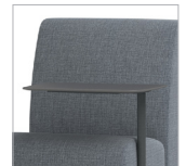
External Tablet with 300 lb capacity (solid surface tablet shown)*