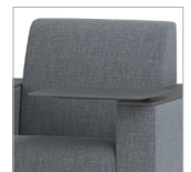
Internal Tablet with 300 lb capacity (solid surface tablet shown in 24\"/>