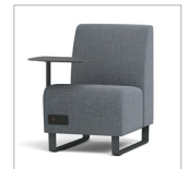
Power Port (specify seated L or R)