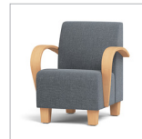
Bent Wood Arm