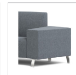
24" h Wedge Table/Arm