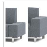
10" w Table/Arm (18" h and 24" h)