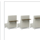
30\", 36\", 42\"/>